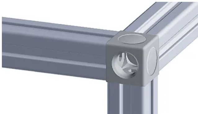
Cube connector 20 loads