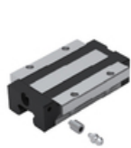
SBI 15-25 FL/FLL side grease fitting (require one FS nipple connector)