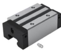
SBI SL side grease fitting