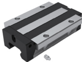
SBI 55 and 65 FL/FLL side grease fitting