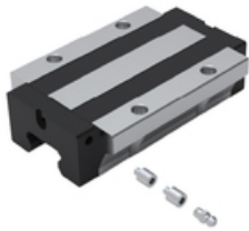
SBI 30-45 FL/FLL side grease fitting (require two FS nipple connectors)